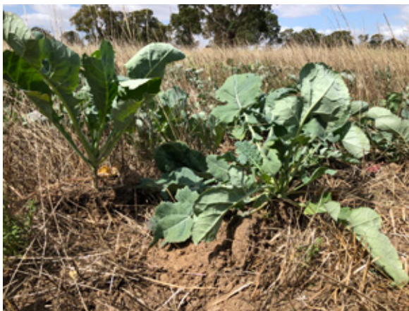
Growth habit showing Blue Gorilla's short and dense habit. LHS = Giant type rape, RHS = Blue Gorilla.

Blue Gorilla is a result of AGF's access to a Wide World of Seeds. Evaluation, along with farmer and agronomist feedback, has proven Blue Gorilla to be a great value forage rape. Blue Gorilla offers a package of higher than average dry matter content, high leaf:stem ratio, reduced early senescing compared to older varieties, good palatability, club root resistance and excellent regrowth.